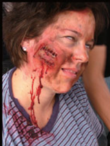
Prosthetics pieces made by Theta Effect