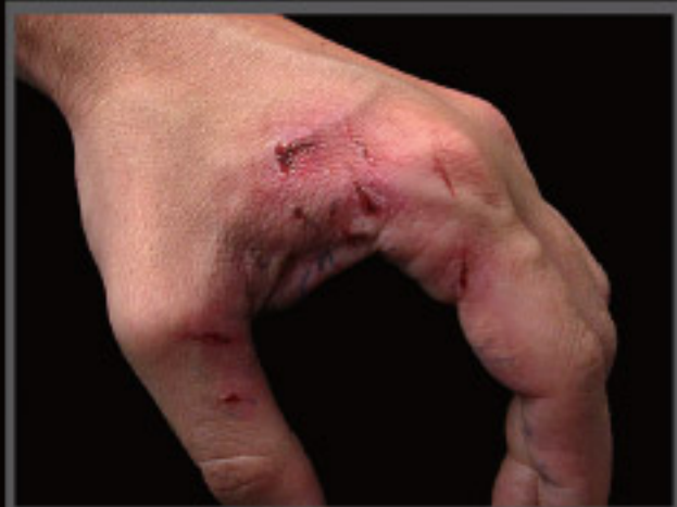
Independent Film Light / Actor got hurt by pen