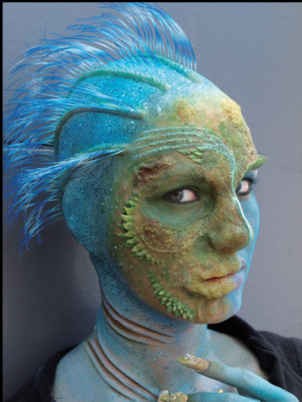
Sea creature / Galetine Pieces/Bald cap/Hand made Fin by fish line and nails