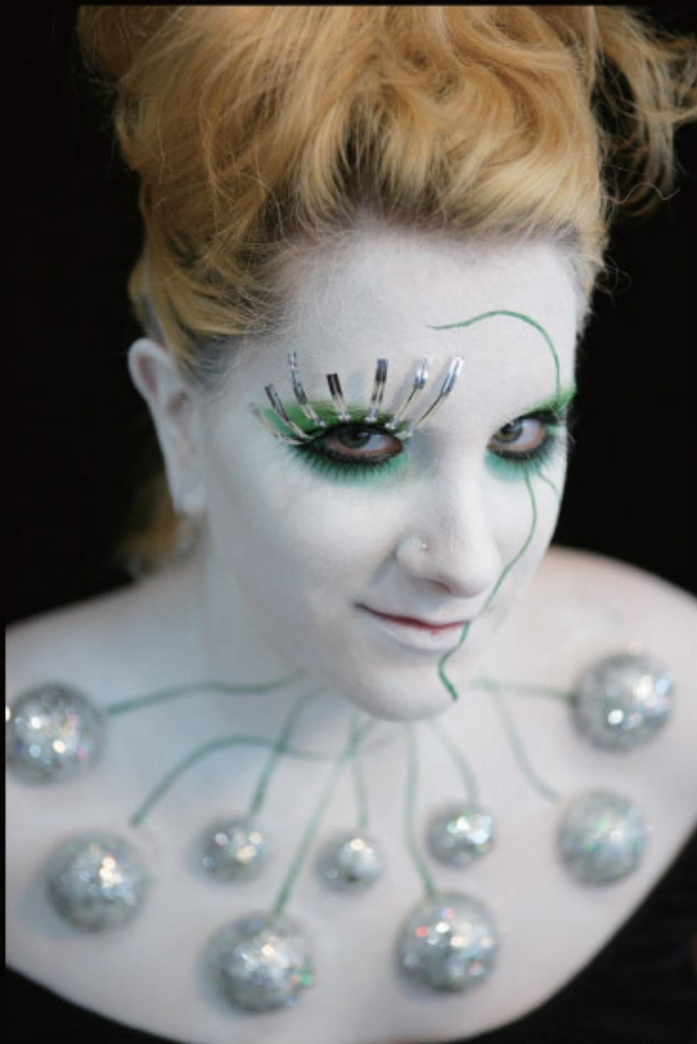
Hand made silver balls and false lashes