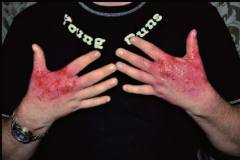
2nd degree burn