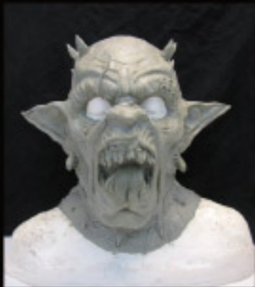
Full Head Mask/ rubber Latex/ hand punch Hair/Hand made rings