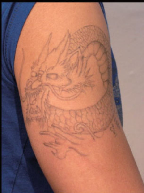
4 Hours Hand Paint Tattoo