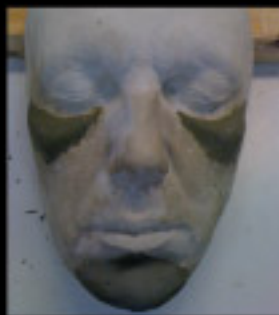
Independent Film RED MOON / Foam Latex/ bald cap