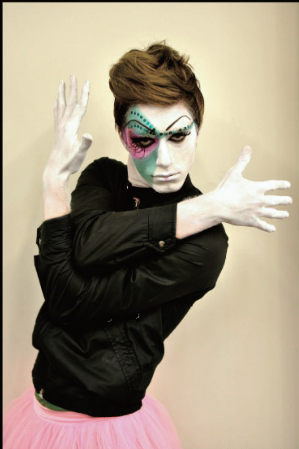
Contemporary Dance Stage Makeup