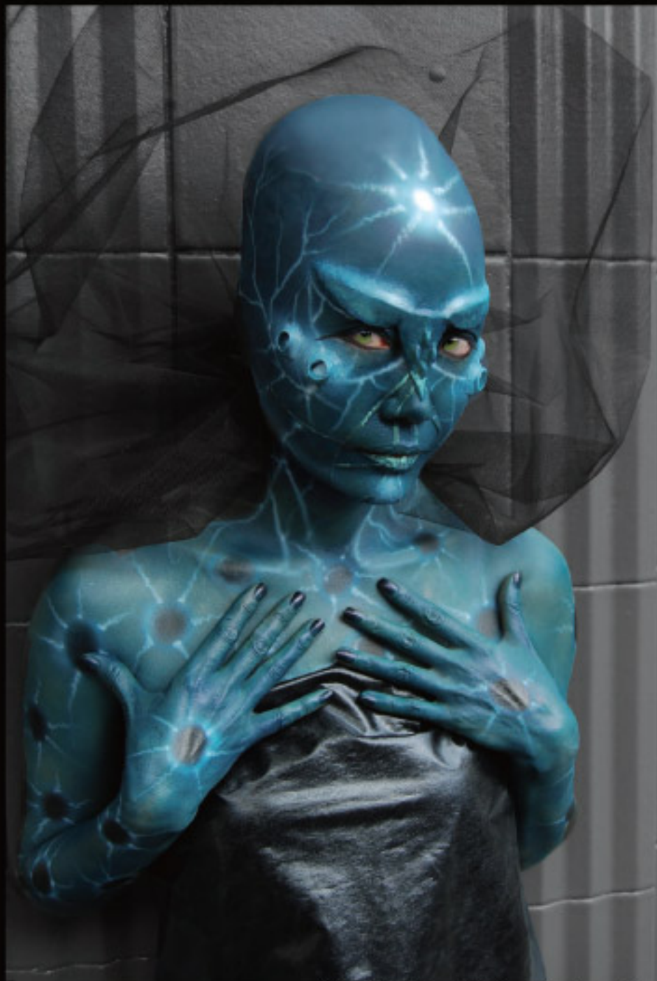
Alien/ Wax Pieces/ Bold cap/body painting