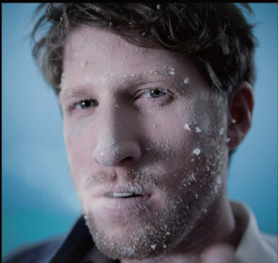
3D Green Screen Animation Project