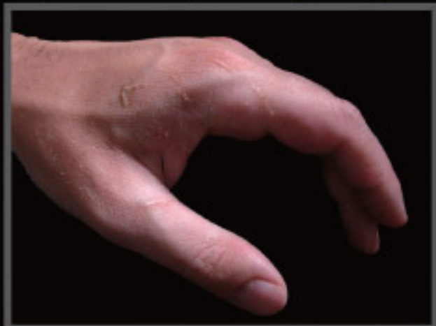
Independent Film Light / Recover few years later.